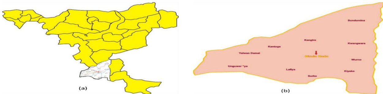
Figure 1. Illustration (a) the map of Jigawa state (b) map of Birnin kudu local government area as a study area comprehensive sample preparation and analytical analysis.